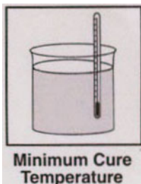
Minimum Cure Temperature

Approximate coverage is 4 – 6m 2 per 1 kg unit